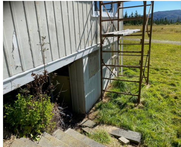
There is a generator shed beside the hangar. There is a storage room underneath the club hut, at full ceiling height.