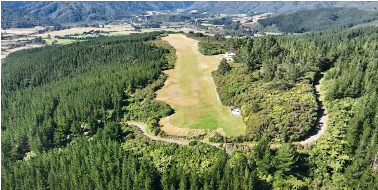
Former glider club runway open space and access track. There will be temporary disruption to access in future when the surrounding plantation forest is harvested.

We welcome your questions. Please email parksplanning@gw.govt.nz or come along to an open day if one is organised. You can also phone the Pākuratahi Park Ranger via our Contact Centre - 0800 496 734.