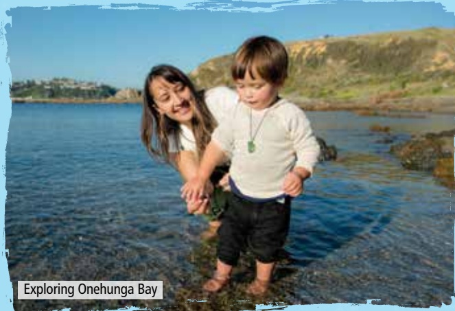
Exploring Onehunga Bay