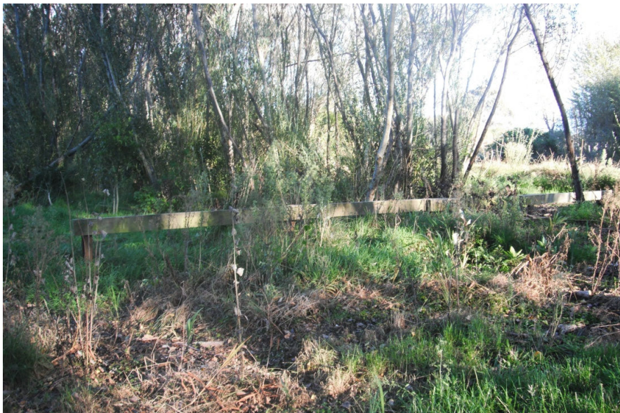
3 Timber groyne (left bank near XS 370)