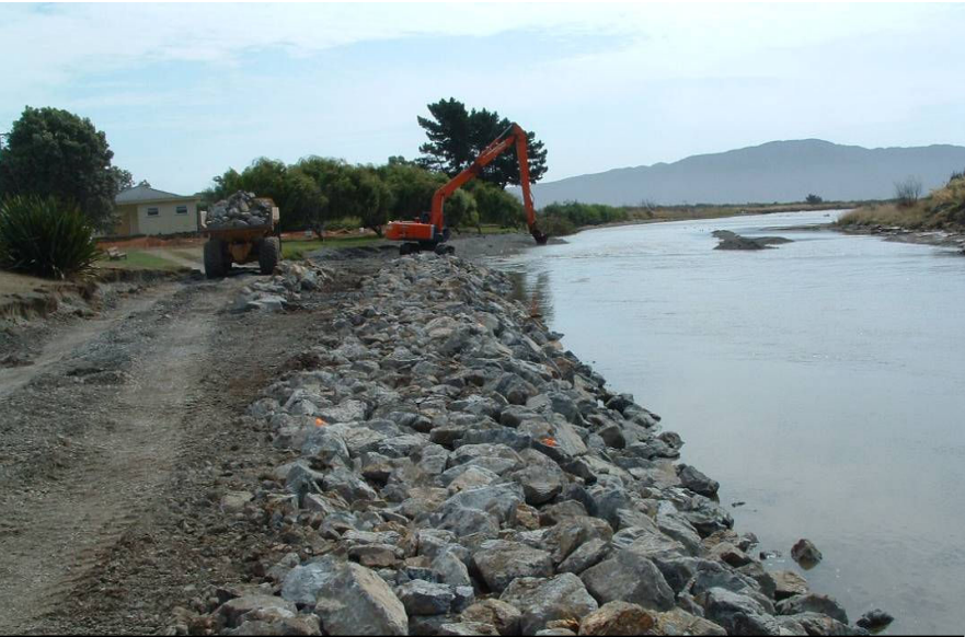
4 Rockline construction (Otaihanga)