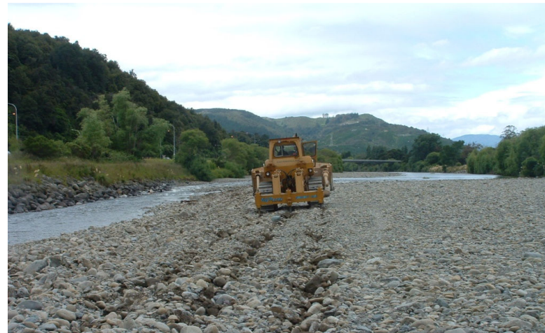
14 Beach ripping (Hutt River)