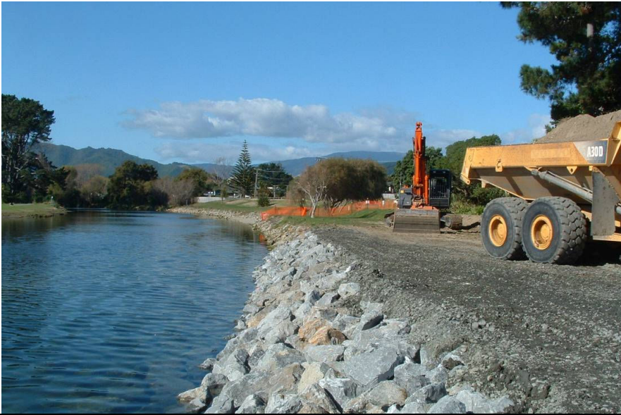
5 Rockline extension (Otaihanga)