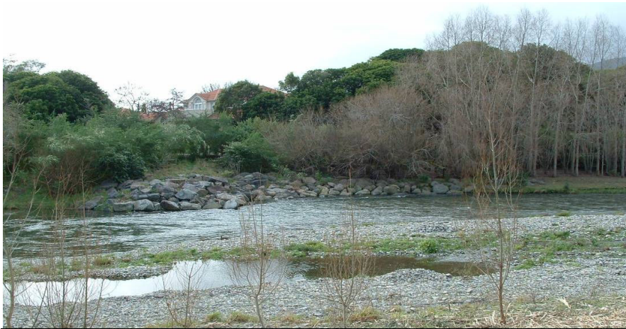
1 Rock groyne at Maple Lane