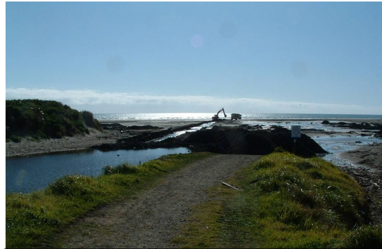
16 Cutting channel downstream of bund (Waimeha)