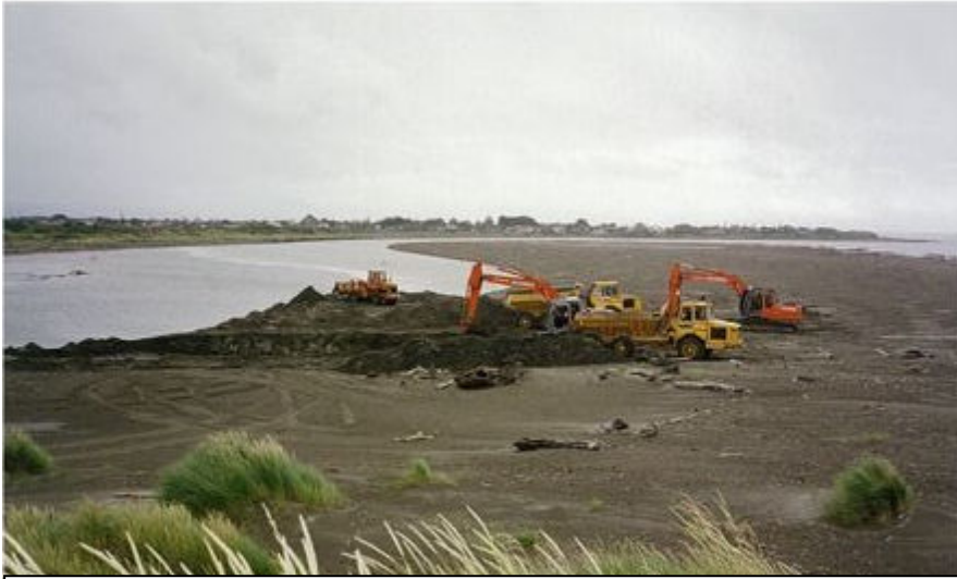
18 Waikanae River – mouth cut December 2001