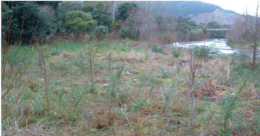
6 Planted willows