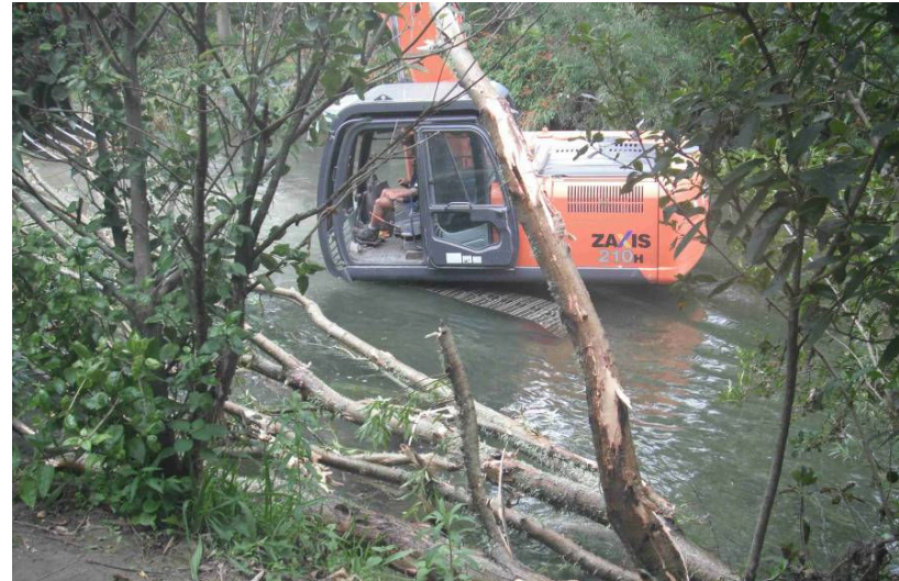
7 Tethering willows