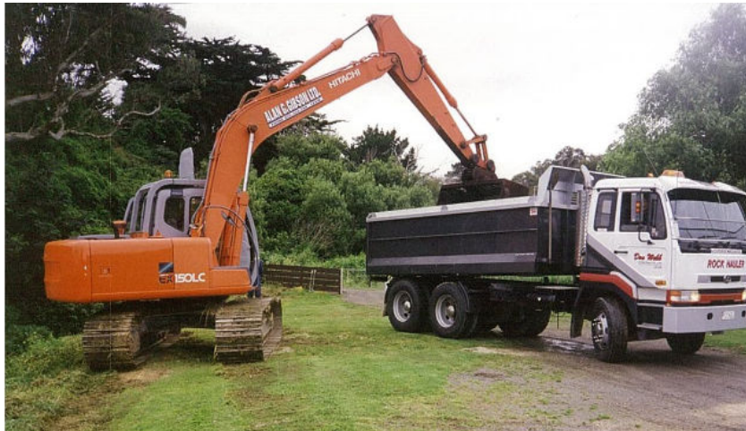
13 Drain clearing – Waimeha Stream