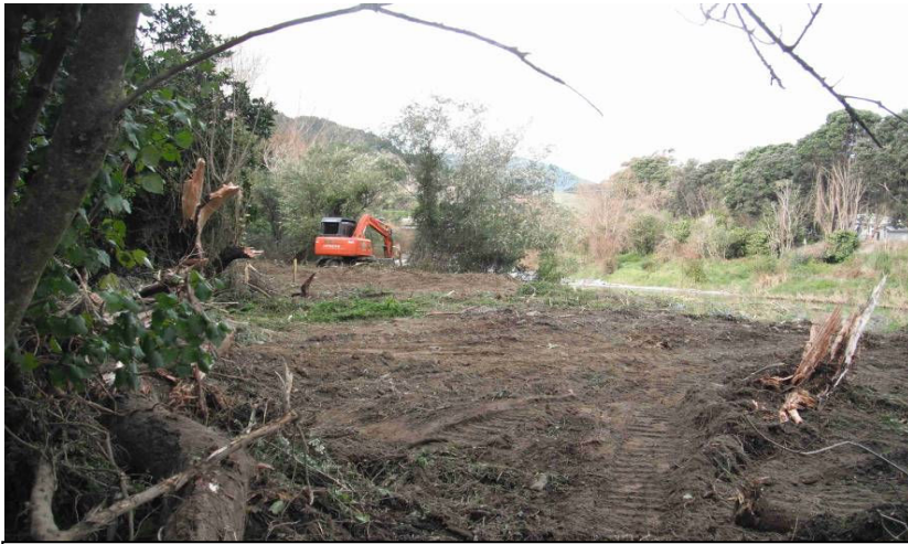
11 Mulching vegetation