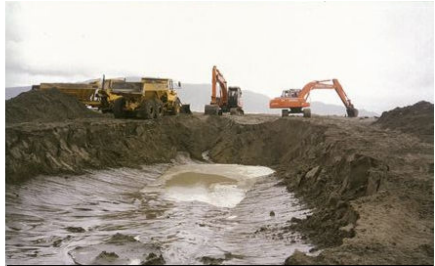
19 Waikanae River – mouth cut December 2001