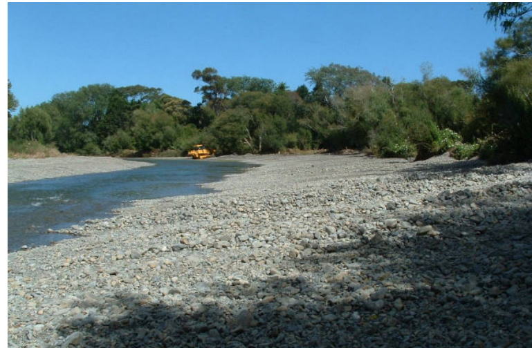
12 Bed recontouring (Blakes corner XS 220)