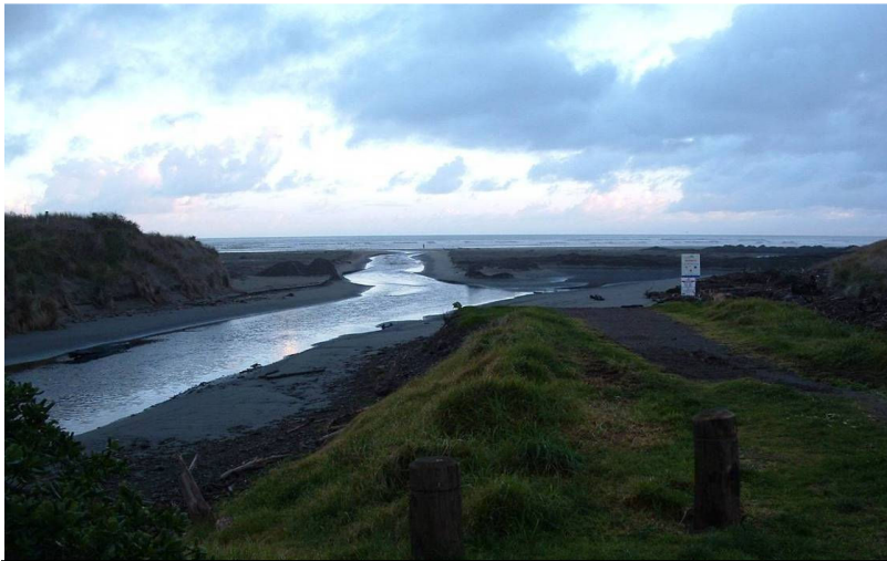
17 New channel open (Waimeha Stream)