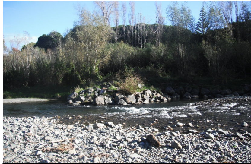
2 Rock groyne