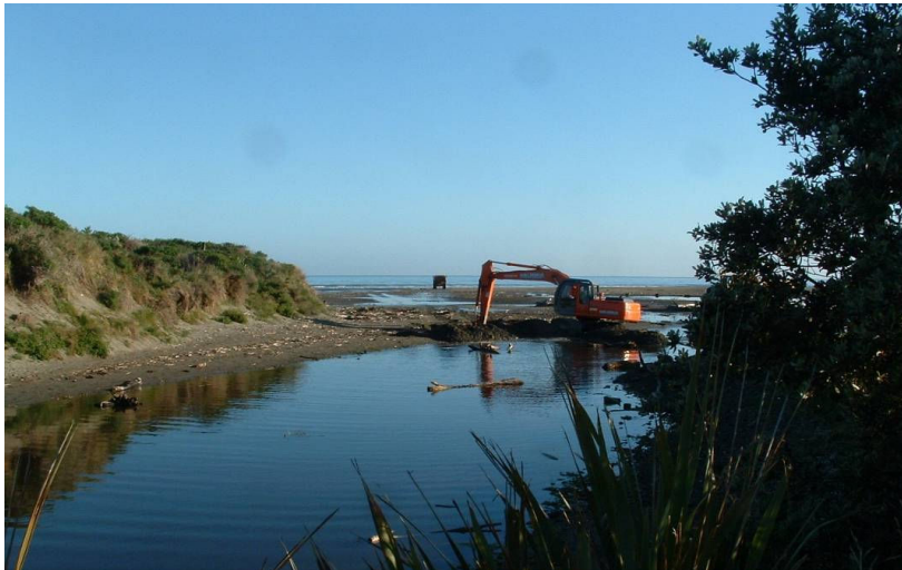
15 Formation of bund to block mouth (Waimeha Stream)