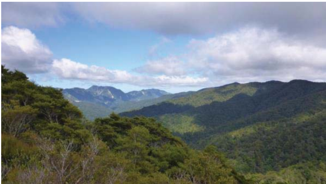
Ki uta ki tai – from the mountains to the sea, water is life

Given the closed and limited public access to the water collection areas, the Plan is also intended to act as a general reference document for people with an interest in these areas. An action in the Plan is to complete and publish the Draft Resource Statement for the water collection areas which will provide further detail of the significant values of these areas.