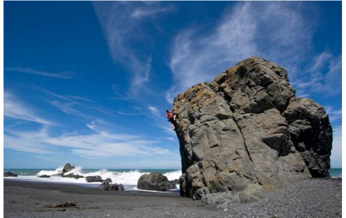
Baring Head coastline boulders

At Baring Head, the Friends continued to restore the historic pump shed. A new door has been installed, exterior weatherboards sanded and an undercoat of paint applied. GW officers continue to attend their committee meetings and provide onsite assistance with the pump shed project.