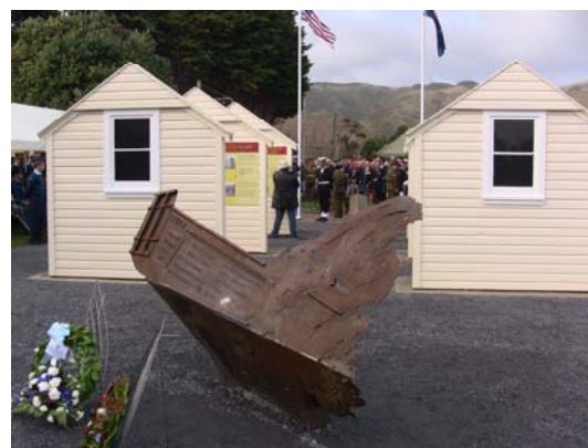
New sailors' memorial unveiled in Queen Elizabeth Park as part of marine's 70th anniversary