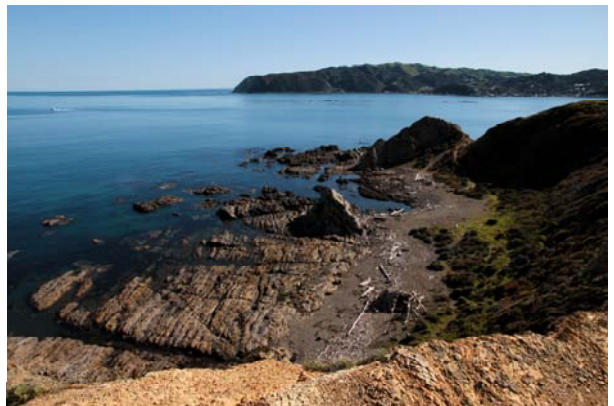
Whitireia Park on a great day

This planting will be undertaken by contractors and will be completed by the end of August.