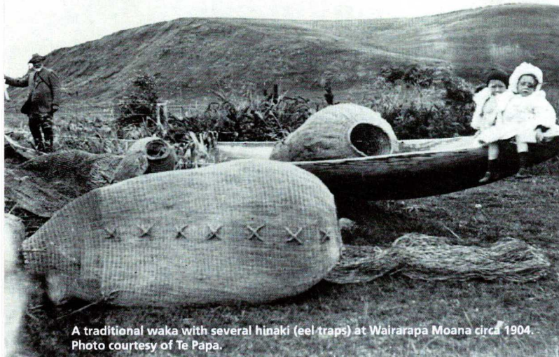
A traditional waka with several hinaki (eel traps) at Wairarapa Moana circa 1904.