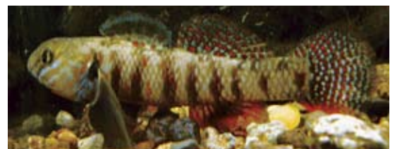
Male redfin bully