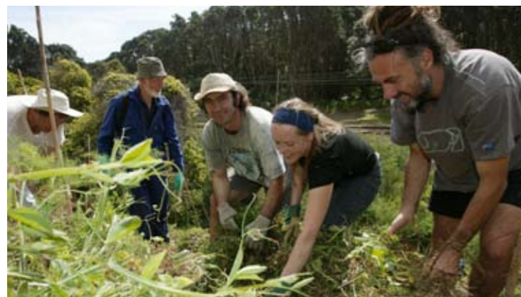
Nga Uruora – Kapiti Project: winners of the 2007 Rata Community Partnership Award