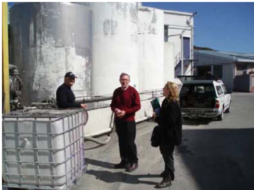
Take Charge visit to Resene Paints, Naenae

The Pollution Control Team has completed eight EnviroSMART audits during the period. Each audit includes a site visit and a written report with recommendations. We will soon be conducting revisits to ensure all recommendations have been completed.