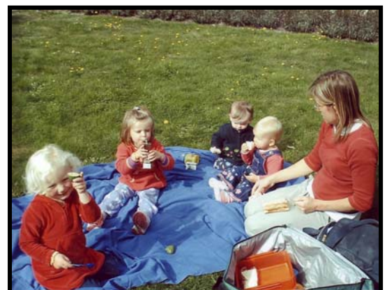
Family enjoying picnic

Camping has slowed down since Easter, but with the incredibly fine weather the visitor numbers in the weekends are still very high with lots of family groups, horse riders, walkers and mountain bike riders making the most of the sunny winter days.