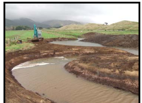
Whareroa Stream project

The Friends of QEP have been hard at work on their Whareroa Stream project. Some earthworks have been done, a temporary track has been set up and signage for the track has been ordered. The community is