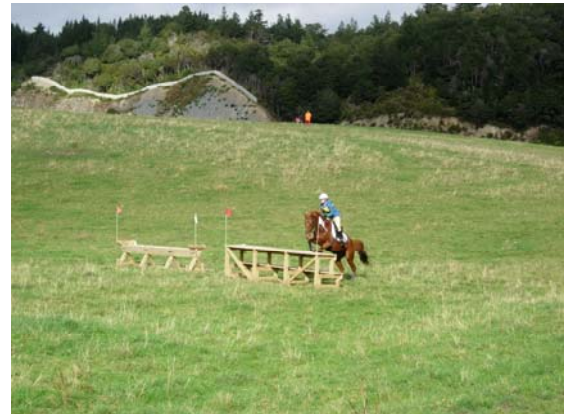
Te Marua Pony Club cross country event

The Te Marua Pony Club which leases grounds within the park held their annual cross country event in which more than 90 riders took part.