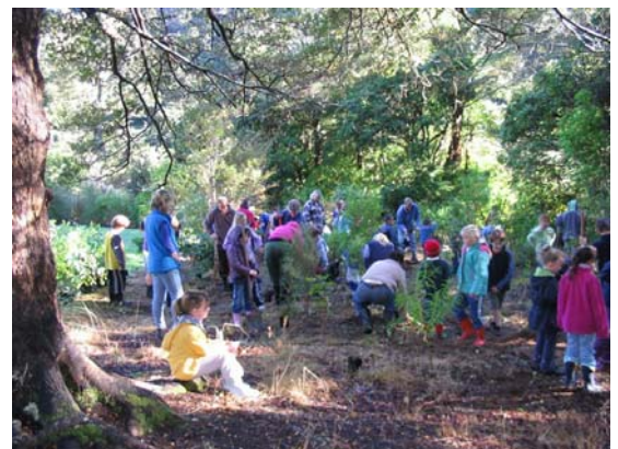
Arbor Day event with Plateau School

Three planting events were held for Arbor Day with Plateau School, Heretaunga Scouts and IAG Ltd. Over 1500 seedlings were planted at sites in Te Marua and the campground area.