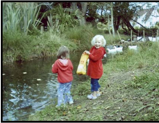
Children feeding the ducks

Transit NZ and Opus Consultants have been undertaking preliminary survey and geotechnical investigations for the Transmission Gully route. The investigation involves a walkover of the route to identify geotechnical features and the identification of sites for more intensive investigations of soil and rock samples.