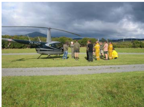
Staff from GW, DoC and Upper Hutt Volunteer Rural Bush Fire Force benefit from safety around aircraft training

During this period a rural fire training exercise for GW and DoC staff and members from the Upper Hutt Volunteer Rural Bush Fire Force was undertaken in the forest. This training exercise was centred around the use of aircraft, both helicopter and fixed wing, and the aim of this training programme was for all participants to attain the Unit Standard for Safety Around Aircraft. I am happy to say that all of the persons present at the course passed with flying colours, and all participants agreed that this was a worthwhile exercise and they thoroughly enjoyed the day.