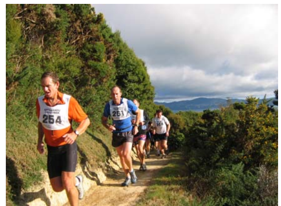
Crazyman Multisport competitors

The hill run section of the Crazyman multisport event was held in the northern forest block attracting 354 competitors. The 18 km run utilises a number of tracks in the park starting at the Bus Barn/Korohiwa track at the southern end of Eastbourne and finishing on the Puriri track at the northern end of Wainuiomata.