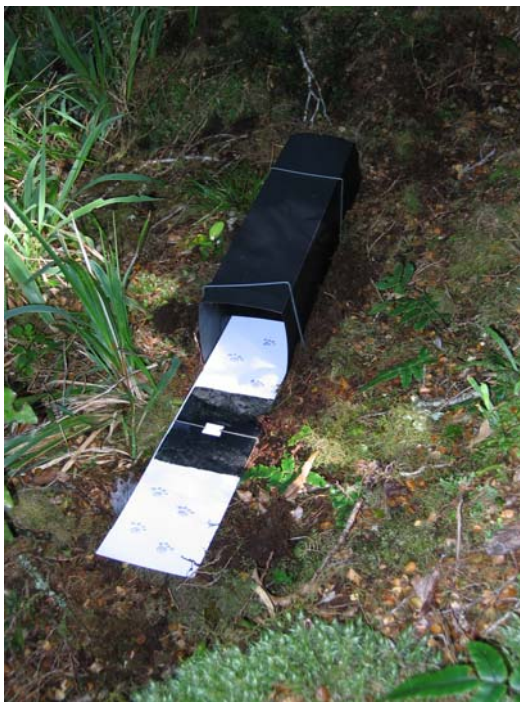
Rodent/mustelid tracking tunnel

The three-monthly East Harbour Regional Park rodent/mustelid monitor was completed in May. The results are not available as yet, but there is an indication that there is a surge in rat numbers in Wainuiomata (see Wainuiomata Mainland Island below). Extra lines have recently been installed at the northern end of the East Harbour mainland island to limit the rat re-invasion from the Wainuiomata side of the park.