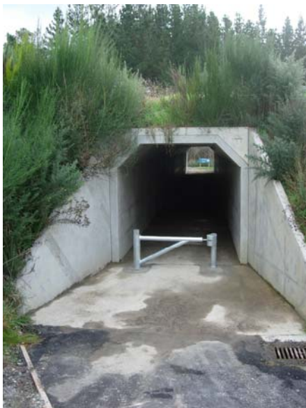
Kaitoke Hill underpass

Six hundred metres of boundary fences have been replaced on the Pakuratahi Terrace leases to prevent cattle escaping and heading over the access road into the Hutt Water Collection Area.