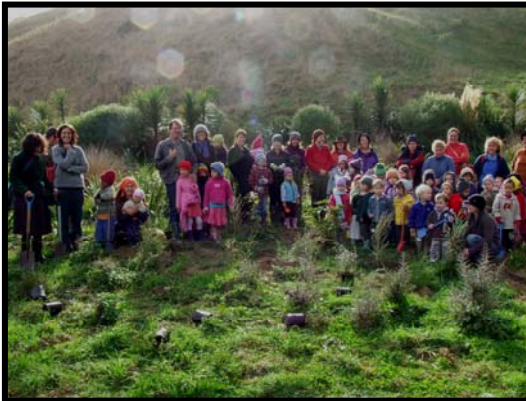
Local playcentre kids planting

actively utilising this track already. There is still quite a lot to be done, but the group is well on they way. With the track being 'open', they are hoping to attract additional funds to complete the project.