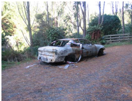
Abandoned and burned out vehicle

We continue to remove abandoned/stolen/burned out vehicles from several areas around the Upper Hutt region. Unfortunately this is an issue the Police struggle to get on top of and we can only assist where possible.