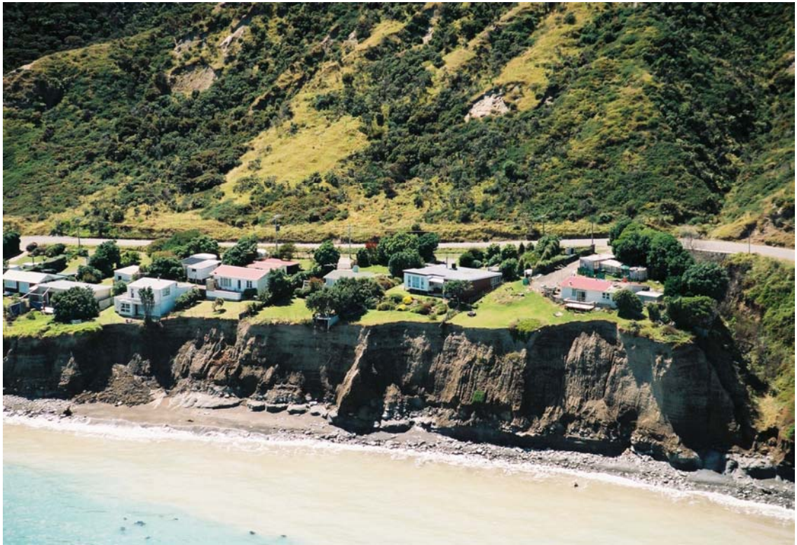
Figure 2: Coastal erosion of soft mudstone at Te Kopi, Pallister Bay (photo taken in 2002)