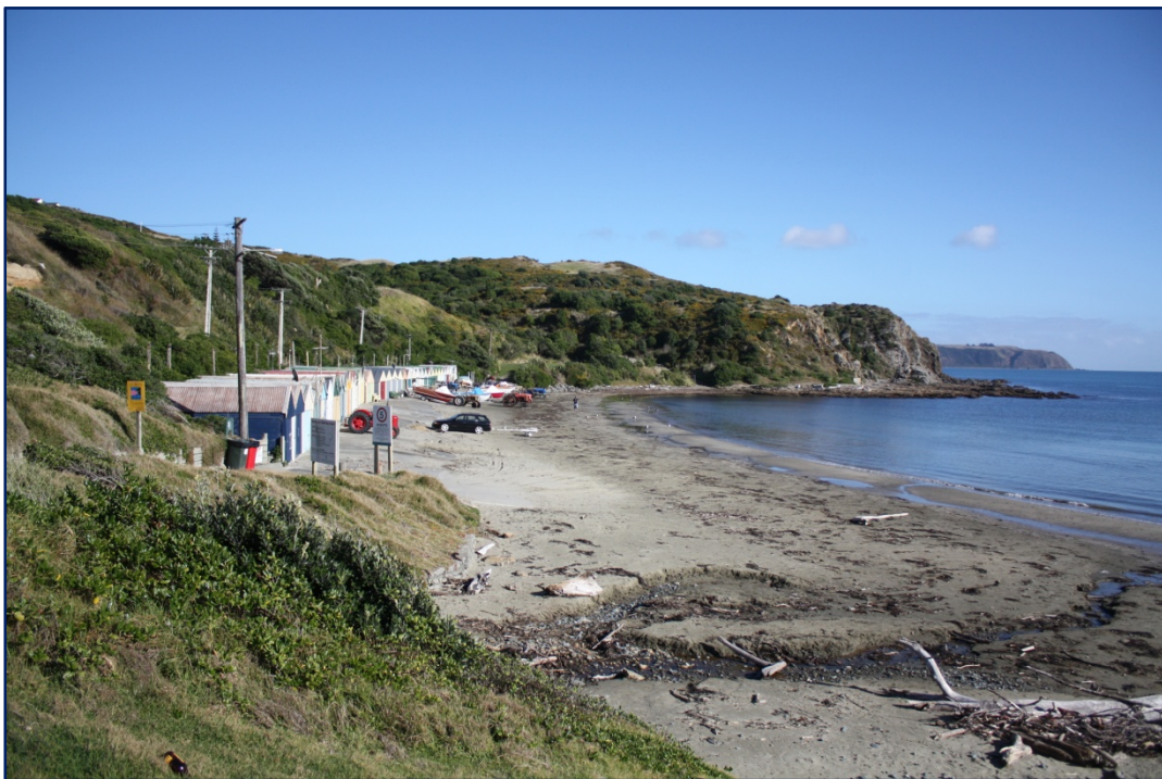
Figure 7: View of the southern end of Titahi Bay beach. Note the impact for the storm water outlet eroding the beach and contributing to the indent in the vegetated dune in the foreground. The vehicle access-way leading to the boat sheds in the centre left will be contributing to loss of sand inland.