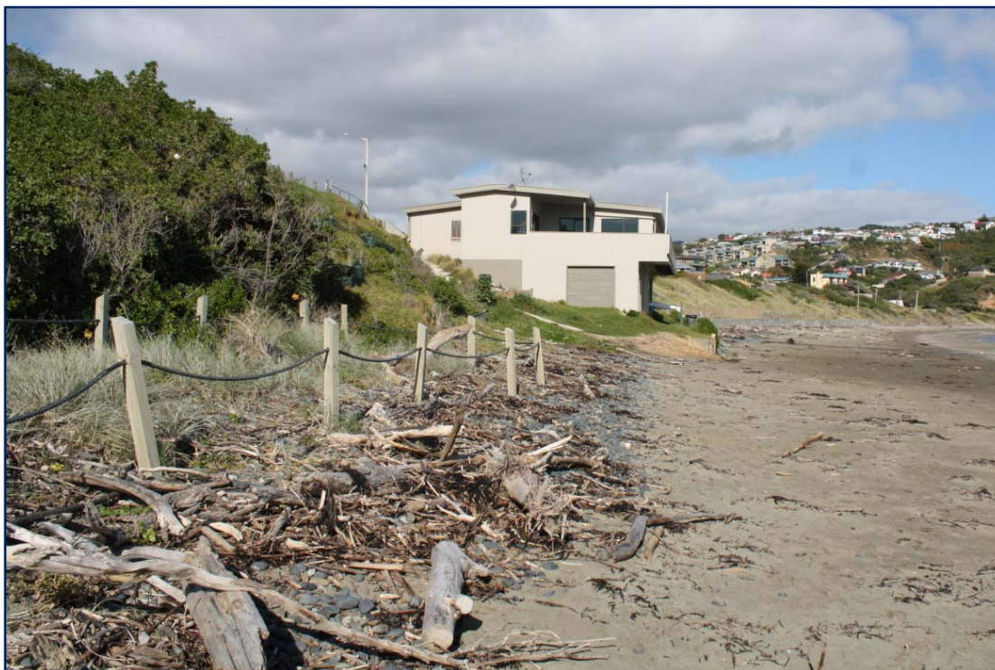
Figure 4: Two plots of spinifex planted within the last 12 months protected from pedestrian traffic by a fence and a steep back landward dominated by shrub hardwoods.