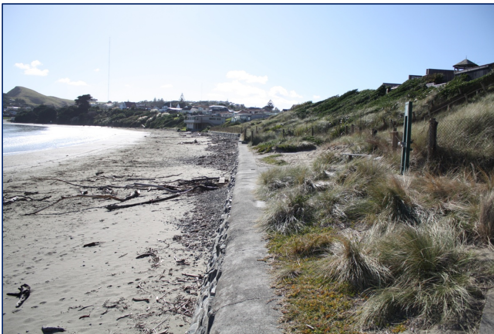
Figure 5: View along the seawall that dominates the central portion of Titahi Bay beach. The seawall is located at or near high water mark where the active foredune zone that historically native sand binding plants is likely to have occurred. Analysis of shoreline positions on aerial photographs since the 1940s indicates the shoreline position has not varied significantly.