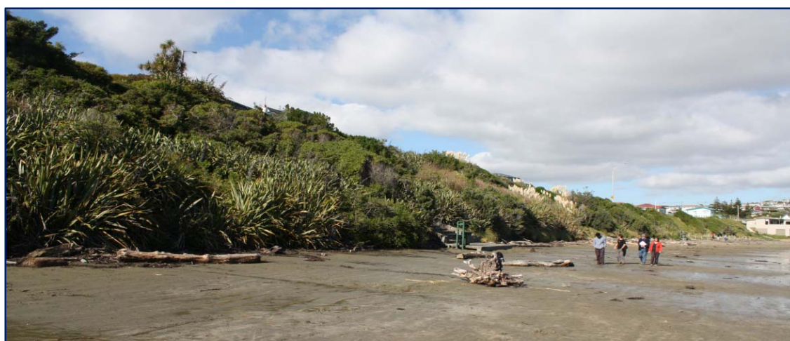
Figure 3: View of the densely vegetated steep bank where there is no high tide beach. The backdune comprises a dense mixture of native and exotic species.