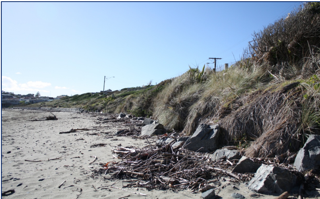
Figure 6: View northwest along Area E. Note the scattered rocks and debris associated with the high water mark at the toe of the vegetated bank.